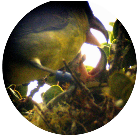
The “supermale” feeding his female, who sits on their nest.

In January 2011, we recaptured the supermale. This had been a goal of ours since we did not have any genetic material from him and he had fathered so many other birds around our study site. With the current genetic analyses that MFBRP is doing, he may be the key in understanding the diversity structure in that part of the population.